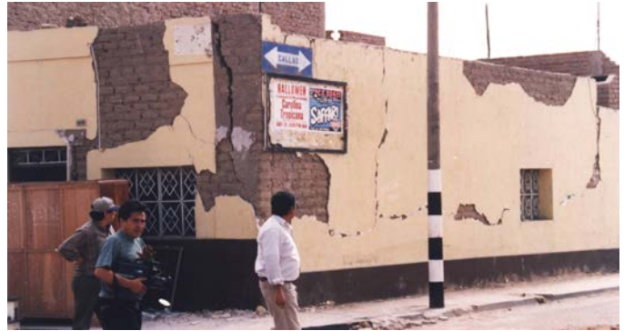
Fig. 2. Typical cracks on adobe houses due to out-of-plane seismic forces.