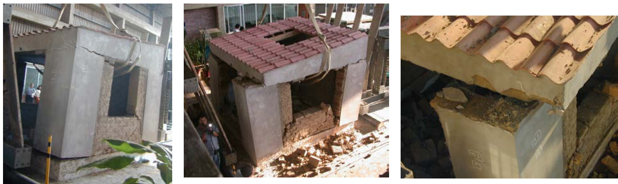
Fig. 8. Behavior of the module during the catastrophic earthquake simulation test (left), after the test (middle), and failure of the plain concrete shear key (right).

A conclusion driven from this test was that the seismic behavior of the proposed system for reinforced adobe houses can be still improved, in order to withstand even catastrophic earthquakes. The new features could include vertical dowels to connect the foundation with the wire mesh strips, reducing the rocking observed, and on the other hand, reinforcing the upper key with vertical dowels, to control the shear friction failure observed (fig. 8).