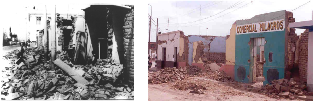
Fig.1. Collapse of traditional adobe houses due to severe earthquakes in Peru.

which usually cause human casualties and loss of properties (fig. 1). The main objective was to provide the adobe house with the enough seismic resistance, so that the habitants could get out before it collapsed.