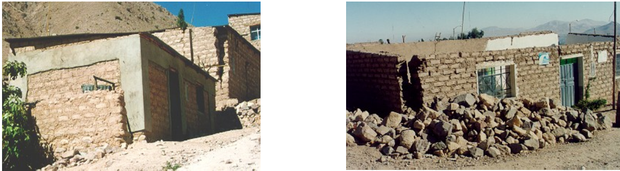
Fig.5. Reinforced house and unreinforced neighbor houses after the 2001 earthquake.

The earthquake of June 23, 2001 ( M_w=8.4 ) caused important damages, especially at traditional adobe constructions located in the south of Peru (Arequipa, Moquegua, Tacna). However, the 6 houses that were reinforced with the system proposed in this paper: three at Moquegua, two at Tacna and one in Arica (Chile), withstand the earthquake and the aftershocks without any damage, while neighbor houses had severe damage or collapsed (fig. 5), see Zegarra et. al. (2002) [6].