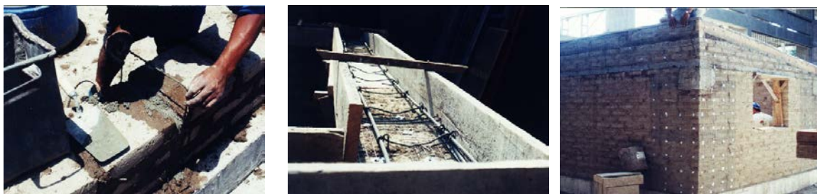
Fig. 7. Some structural improvements in the new adobe houses: wire connector in joint (left), collar beam (middle), and shear key (right).

Some of the structural improvements, designed at PUCP, are indicated in fig. 7, and include the following: 1) use of plain concrete for the foundation; 2) the construction procedure, like the wetting of the adobe units before placement, the use of a marked stick to control the 2 cm joint width, the installation of the connector at the vertical joints covered with cement mortar; and, 3) the collar beam of poor concrete ( f'c=10 Mpa), used as lintel in doors and windows, reinforced with two #3 bars.