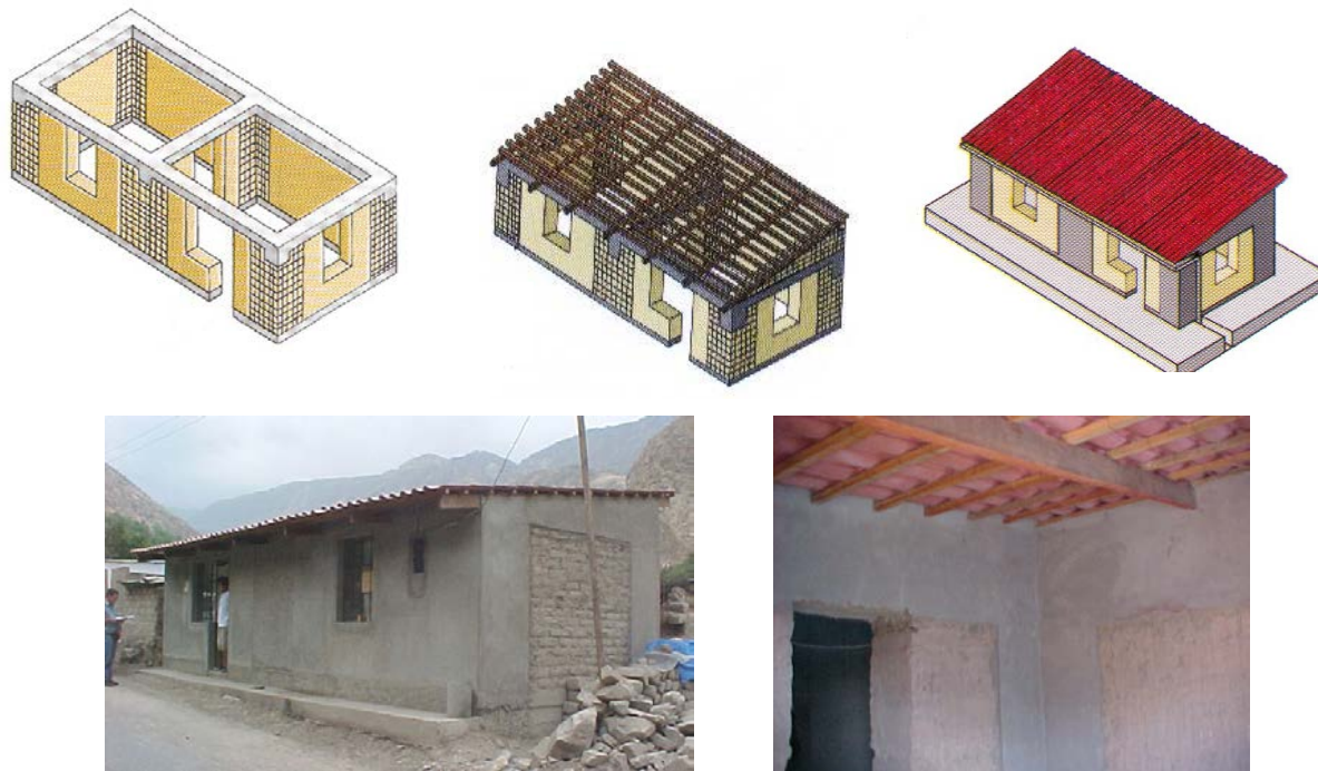
Fig. 6. Views of the new reinforced houses built in Arequipa.

The basic module architecture is shown in fig. 6, in which the vertical strips of wire mesh covered with mortar may be appreciated.. The module was conceived in such a way that could be adapted to different areas and that future modules for expansion could be added by duplicating this basic module.