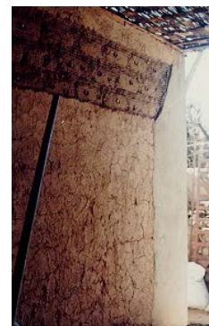
Fig. 4. Reinforcement for existing 2-story houses.