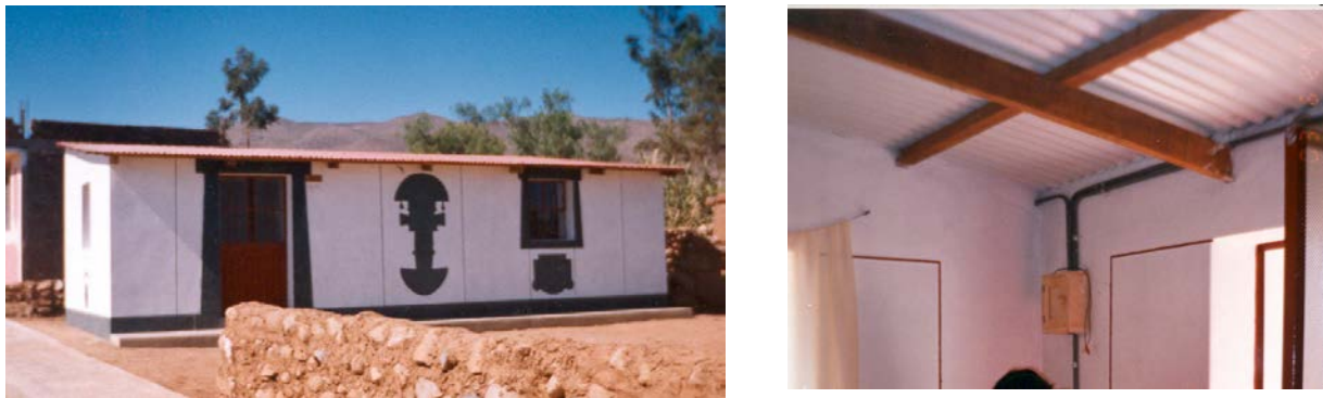
Fig. 9. New adobe house built by PNUD-SENCICO.

In this program, almost 100 adobe houses have been constructed, following the module plans initially developed by the COPASA-SENCICO-PUCP team. Most of these houses have the roof with a single slope, and a small amount have a two-sloped roof. The roof cover is of metal sheets. In fig. 9 some of the houses of this project are shown, in which it can be observed the correct location of the visible electrical installations by the outer side of walls and roof, in order to keep the structure intact.